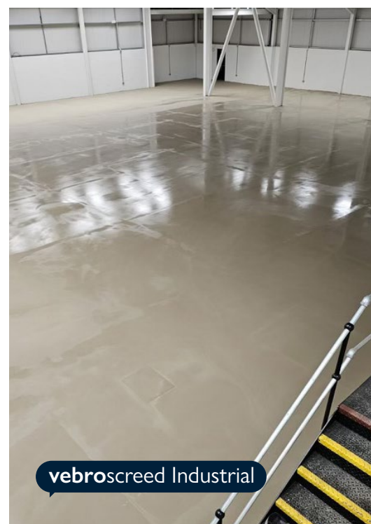
vebro screed Industrial