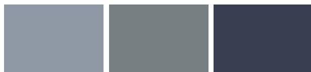
RAL 7040 Window Grey