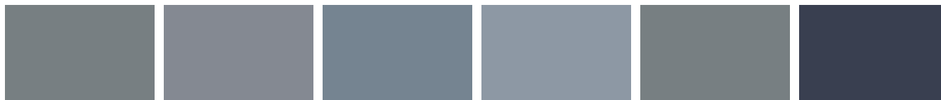
RAL 7037 Dusty Grey