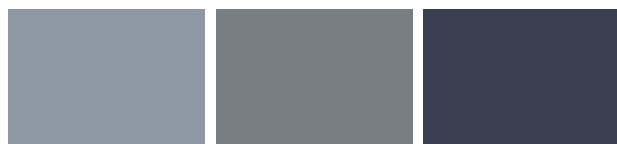
RAL 7040 Window Grey