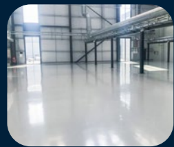
industrial & manufacturing