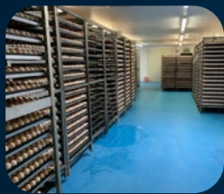
food & beverage