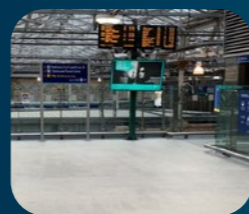
transport & infrastructure